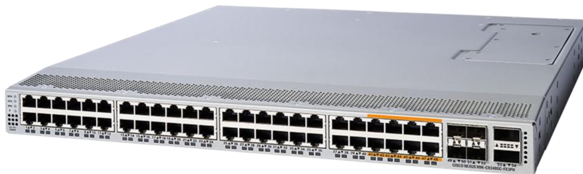
Figure 5. Cisco Nexus 9348GC-FX3PH Switch

The Cisco Nexus 9348GC-FX3PH Switch (Figure 5) is a 1RU switch that supports 696 Gbps of bandwidth and over 517 Mpps. The 40 1GBASE-T downlink ports on the 9348GC-FX3PH can be configured to work as 10-Mbps, 100-Mbps, or 1-Gbps ports. The last 8 downlink ports can be configured to work as 10-Mbps or 100-Mbps only. The 4 ports of SFP28 can be configured as 1/10/25-Gbps, and the 2 ports of QSFP28 can be configured as 40- and 100-Gbps ports, or a combination of 10, 25, 40, and 100-Gbps connectivity, offering flexible migration options. The last 8 ports are only of half-duplex functionality and are limited to 10Mbps and 100Mbps speeds only.