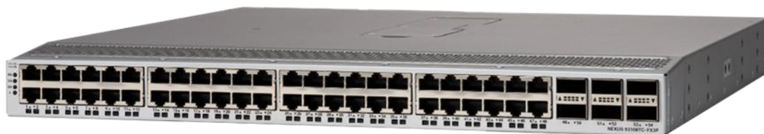
Figure 3. Cisco Nexus 93108TC-FX3P Switch

The Cisco Nexus 93108TC-FX3P Switch (Figure 3) is a compact 1 RU switch that supports 2.16 Tbps of bandwidth and 1.2 Billion packets per second (Bpps). Offering flexible port-speed configurations, the switch supports 48 ports of 100M/1/2.5/5/10G BASE-T on the downlinks. The 6 uplink ports support 40/100G QSFP 28. The 93108TC-FX3P is well suited for network customers requiring more versatility and flexibility in networking speeds.