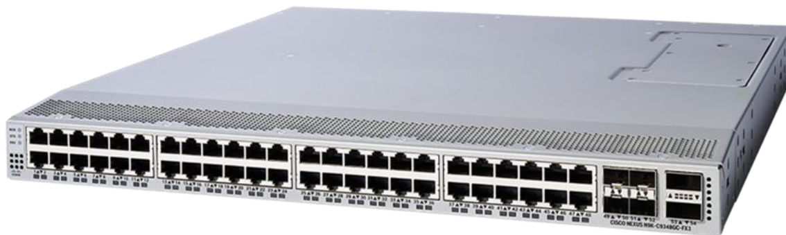
Figure 4. Cisco Nexus 9348GC-FX3 Switch

The Cisco Nexus 9348GC-FX3 Switch (Figure 4) is a 1RU switch that supports 696 Gbps of bandwidth and over 517 Mpps. The 48 1GBASE-T downlink ports on the 9348GC-FX3 can be configured to work as 10-Mbps, 100-Mbps, or 1-Gbps ports. The 4 ports of SFP28 can be configured as 1/10/25-Gbps and the 2 ports of QSFP28 can be configured as 40- and 100-Gbps ports, or a combination of 10-, 25-, 40, 50-, and 100-Gbps connectivity, offering flexible migration options.