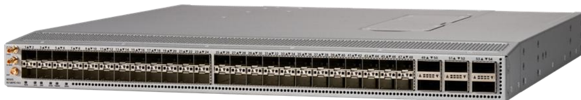
Figure 1. Cisco Nexus 93180YC-FX3 Switch

The Cisco Nexus 93180YC-FX3 Switch (Figure 1) is a 1RU switch that supports 3.6 Tbps of bandwidth and 1.2 Bpps. The 48 downlink ports on the 93180YC-FX3 are capable of supporting 1-, 10-, or 25-Gbps Ethernet, offering deployment flexibility and investment protection. The 6 uplink ports can be configured as 40 or 100-Gbps Ethernet, offering flexible migration options. The Cisco Nexus 93180YC-FX3 switch supports standard PTP telecom profiles with SyncE and PTP boundary clock functionality for telco data-center edge environments.