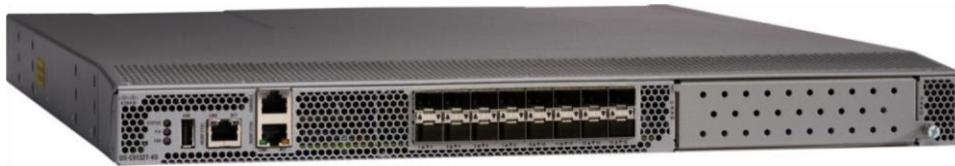
Figure 1. Cisco MDS 9132T 32-Gbps 32-Port fibre channel switch