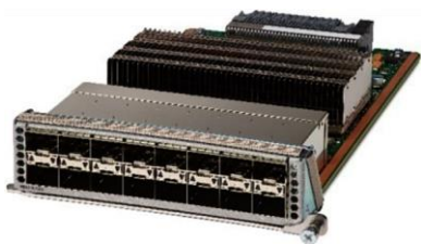
Figure 2. Cisco MDS 9132T 32-Gbps 16-Port fibre channel port expansion module