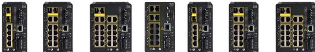
Figure 1. IE-3100 Rugged Series switches models