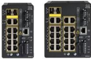
Figure 2. IE-3105 Rugged Series switch models with enhanced feature set