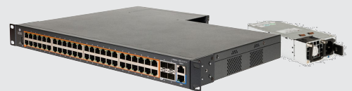
EX2052R-P / CRPS