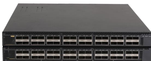
S9820-64H front panel