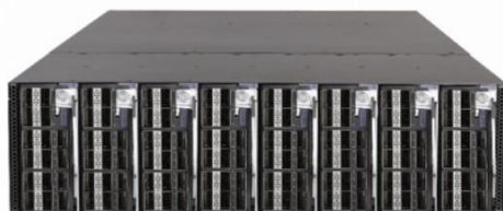
S9820-8C front panel