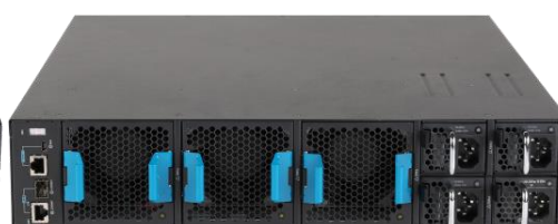
S9820-64H rear panel