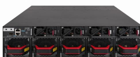
S9820-8C rear panel