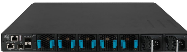
LS- S6850-56HF rear panel