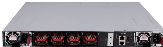
LS-S6850-56HF-H3 rear panel