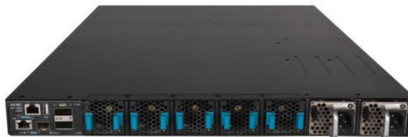
LS- S6850-2C rear panel