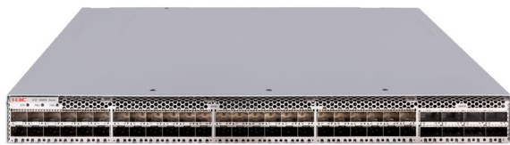
LS-S6850-56HF-H3 front panel