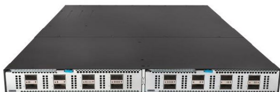
LS-S6850-2C front panel