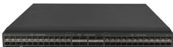
LS-S6850-56HF front panel