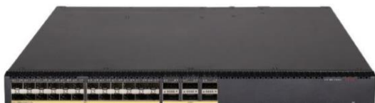
S6812-24X6C Front view