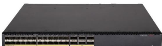
S6813-24X6C Front view