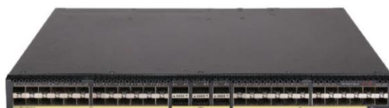
S6813-48X6C Front view