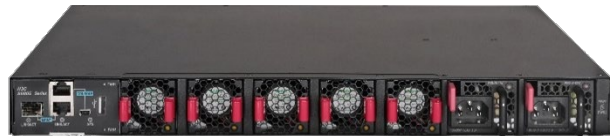
S6805-54HF Rear view