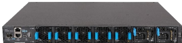
S6805-54HT Rear view