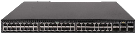
S6805-54HT Front view