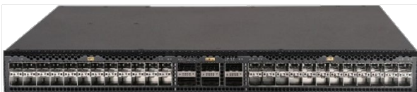
S6805-54HF Front view