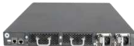
S6800-32Q Rear View