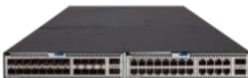
S6800-2C Front View (Module Installed)