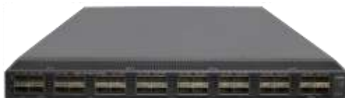
S6800-32Q Front View