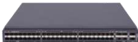
S6800-54QF Front View