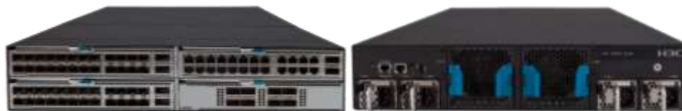
S6800-4C Front View (Module Installed)