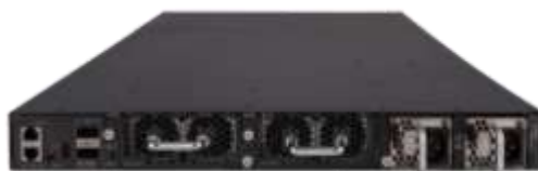
S6800-2C Rear View