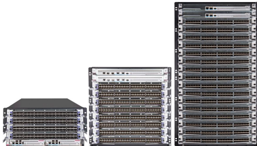
H3C S12500X-AF Switch Series

The S12500X-AF switch series includes S12504X-AF, 12508X-AF and S12516X-AF, which meet various port density and performance requirements. The S12500X-AF switch series can work with H3C routers, switches, security devices, IMC, and H3Cloud to provide a wide variety solutions